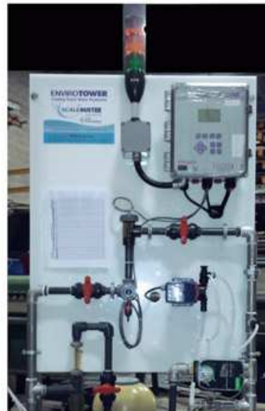
Control Skid Front View

Water softening requires a certain amount of power, either heat power, mechanical power, or electric power. The lowest consumption, and therefore the highest efficiency of CaCO 3 separation is achieved by electric power, which