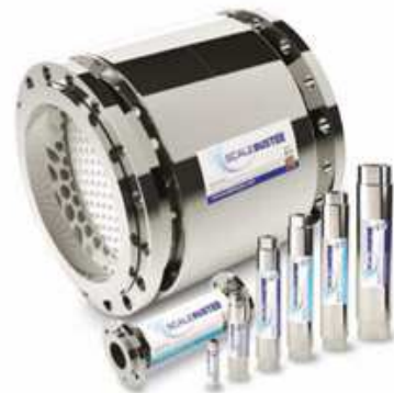
Scalebuster Group Shot