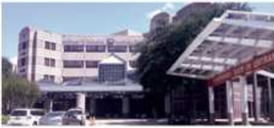
VA Houston Medical Center

of the water. When these particles reach the hot parts of the system the tendency to adhere to the hot surfaces is dramatically reduced. Therefore the ScaleBuster protects the equipment from potential limestone damage. The ISB is conceived to make the particles formed non-adherent. After installation of the ISB, limestone is mainly present in the form of aragonite, which is a non-adherent crystalline structure contrary to the untreated calcite that can cause deterioration and damage in unprotected systems.